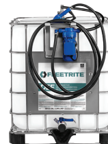
FLTDEFTPP120 (120V SS Nozzle)