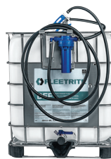
FLTDEFTP120MN (120V Poly Nozzle)